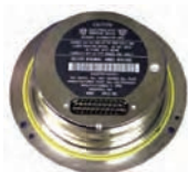
HG1700 Tactical Grade to 1°/hr