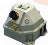
HG9900 Inertial Grade to 0.003°/hr