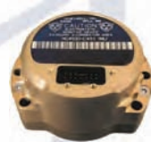
HG4930 NEW NON-ITAR