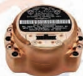
HG1930 Tactical Grade to 20°/hr