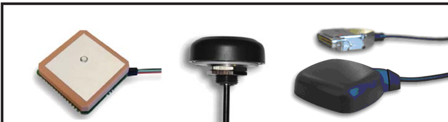
Figure 4: Precision GPS Navigation units with integrated receiver.

Helical Antenna (QFHA) element for greater gain, but still fitting within a small physical package. Various Low Noise Amplifiers (LNAs) are available for suppression of external out-of-band radiating signals.