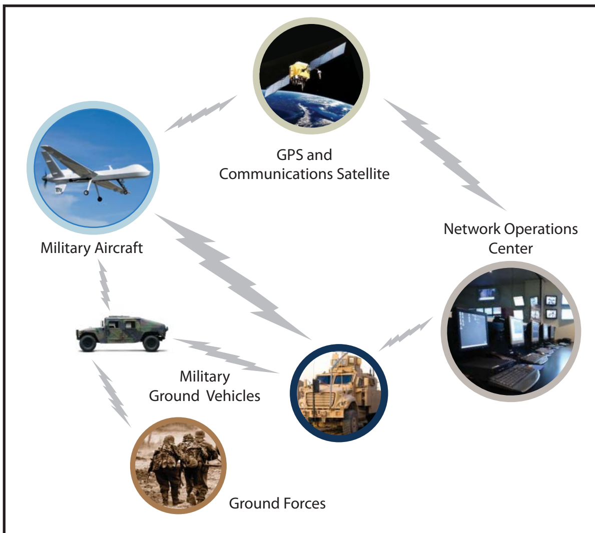
Figure 1: Wireless communications network

And connect the Soldier to the information he or she needs wherever and whenever he or she needs it.’ LandwarNet is described as the Army’s segment of the Global Information Grid with a goal to ‘wire the Soldier into the grid.’ Responding to the changing global security environment is central to the theme of LandwarNet with its goal to change the way our soldiers fight through the way he communicates.