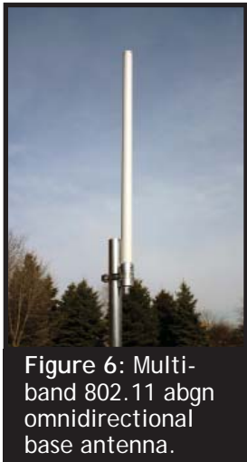
Figure 6: Multi-band 802.11 abgn omnidirectional base antenna.

PCTEL, Inc. (PCTI: Nasdaq) is a leading supplier of specialized military antenna systems. PCTEL's antennas are equipped with features enabling them to achieve a high level of performance under challenging environmental and operational conditions. Munitions Guidance Antennas used for purposes such as controlling missiles are highly ruggedized; Portable SATCOM Antennas are miniaturized for laptop and portable radio communications; Precision Aviation Antennas are GPS and GEO augmented; Airborne Antennas have standardized mechanical features for integration into airframe platforms; and SATCOM and Asset Tracking Antennas have specific mechanical features and configurations for embedding into electronic and mechanical enclosures. Customization of these antennas allows them to function under extreme conditions, including severe vibrations on an aircraft or missile, and severe weather conditions such as sandstorms, while still facilitating reliable, high-speed communication and data transmission.