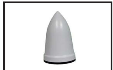
Figure 3: L1/L2 GPS with Quadrifilar Helix Antenna

GPS satellite communications has become a standard technology for both commercial and military users. Standard passive L1 (1575.42 MHz) GPS antennas have evolved into multiband and dualband amplified units that also include the L2 frequency band (1227.60 MHz). These dualband L1 and L2 antennas can be found in different physical form factors, depending upon the application. A stacked patch technology, shown in Figure 2, provides for a very small overall size of less than 50mm x 50mm x 2.5mm. Figure 3 shows another version of this antenna with a Quadrifilar