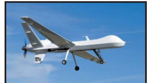
Figure 7: UAV and munitions guidance applications