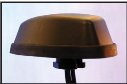
Figure 5: Low profile wide band-width mobile with GPS

Specialized antennas are needed to provide control information to drones and remote weapons used in surveillance or precision strikes. Unmanned Aerial Vehicles (UAV's) have deployed in certain irregular warfare environments to increase soldier awareness and, in some cases, to help identify Improvised Explosive Devices (IEDs). Munitions guidance antennas increase the chances of striking a target. Example applications are shown in Figure 7.