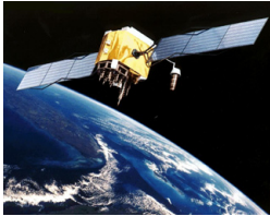
GPS is no longer the only game in town for satellite positioning

The reason for the appearance of numerous new GNSS systems is clear: many countries do not want to be 100% reliant on the US controlled GPS system which could in theory be deactivated or restricted. Designers of GNSS systems are now faced with new motives for designing systems that support multiple GNSS standards: