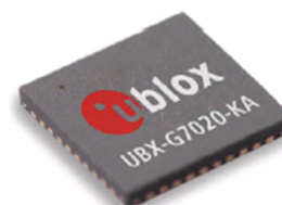
u-blox multi-GNSS chip UBX-G7020-KA 5.0 x 5.0 x 0.6 mm (QFN-40, automotive)