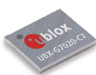
u-blox multi-GNSS chip UBX-G7020-CT 3.0 x 3.4 x 0.6 mm (Chip Scale Package)

To help system designers address the expanding range of GNSS systems and augmentation services, as well as other demanding criteria such as low power consumption and small size, u-blox has paid special attention to the following design considerations with the release of u-blox 7, the company's fifth-generation GNSS receiver platform based on the new UBX-G7020 multi-GNSS receiver chip: