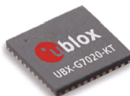
u-blox multi-GNSS chip UBX-G7020-KT 5.0 x 5.0 x 0.6 mm (QFN-40)